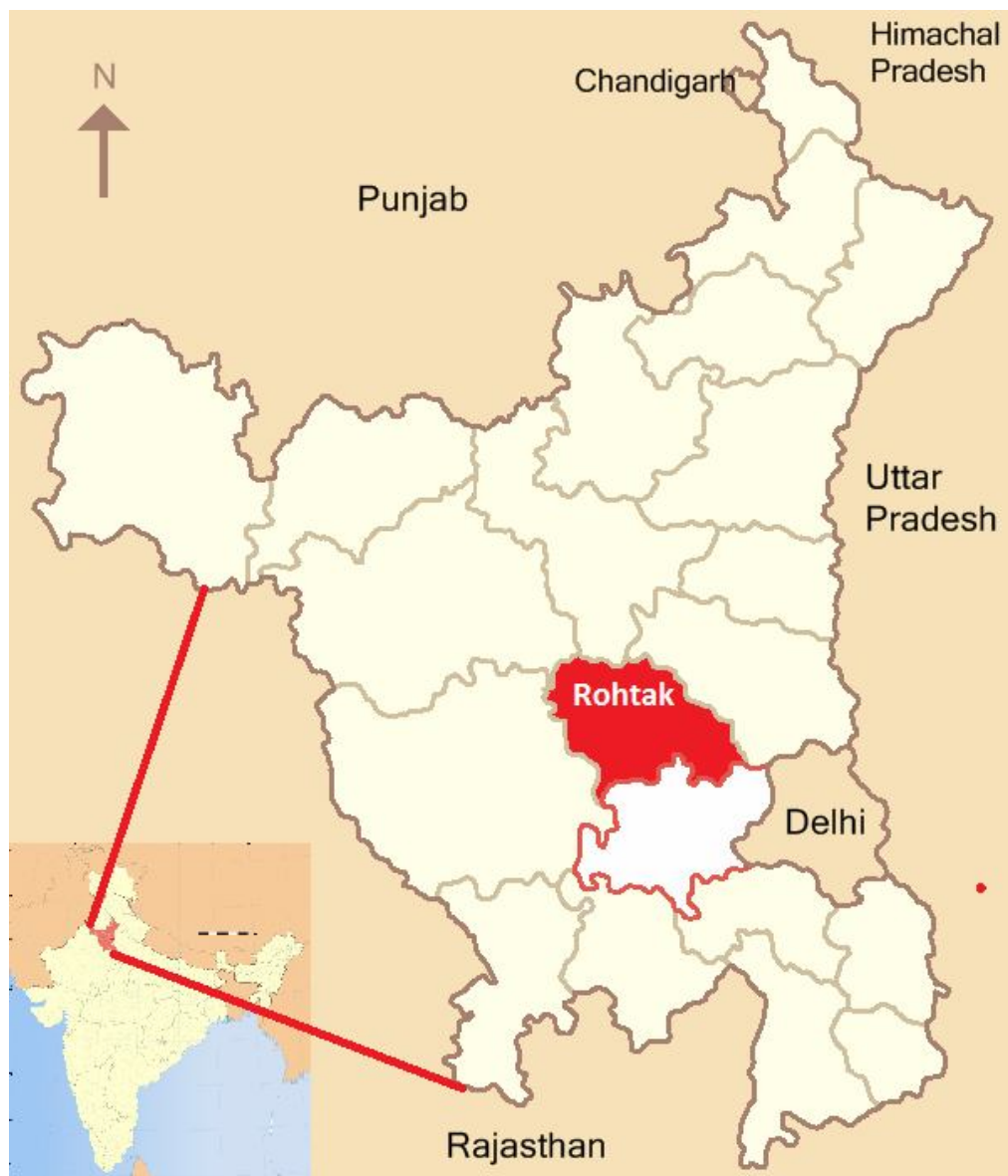
Fig. 1: Map of the study site